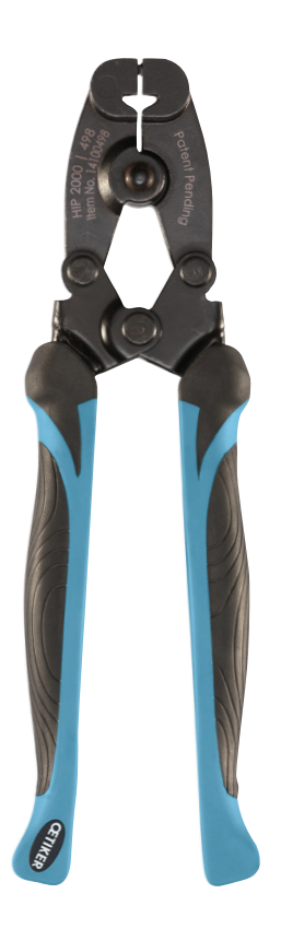
Hand Installation Pincer, Straight Handles, Side Jaws