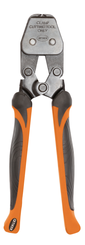
Hand Clamp Cutter, Straight Handles